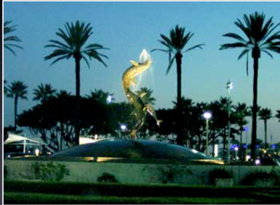
Rainbow Harbor Fountain