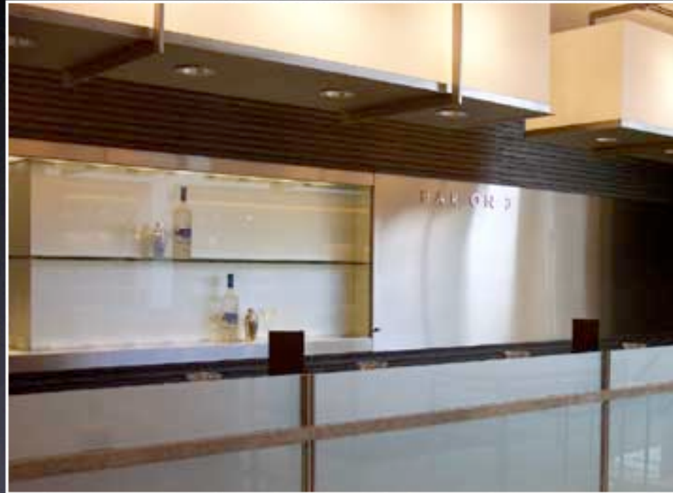
Neiman Marcus Bar