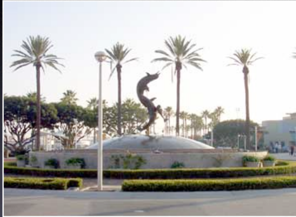
Rainbow Harbor Fountain